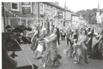
Photograph of Carnival Parade