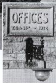
Photograph of Kay Metzeler entrance and offices

Bollington Live! is your magazine. If you have any stories or reminiscences which might be of interest, please send them to the address at the top of this page by the 27th May.