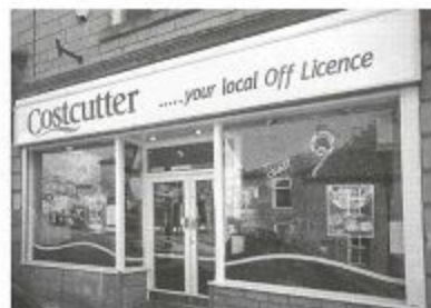
Opposite Page

happy-valley.org.uk/organisations/welldress.htm