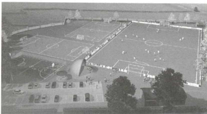
Left: Artists' impression of the future of Bollington Cross Youth Project.

Date for next copy: Friday 1st. Oct. 2010