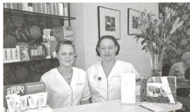
Below: Ladies at 'Little Luxuries'.

Of course we have always had lots to see but we've been a bit short on the doing. People have visited the town for years to look at our