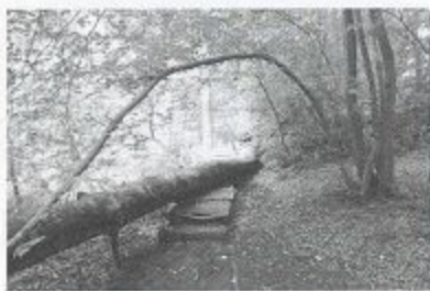
Top Left: Before the restoration work,