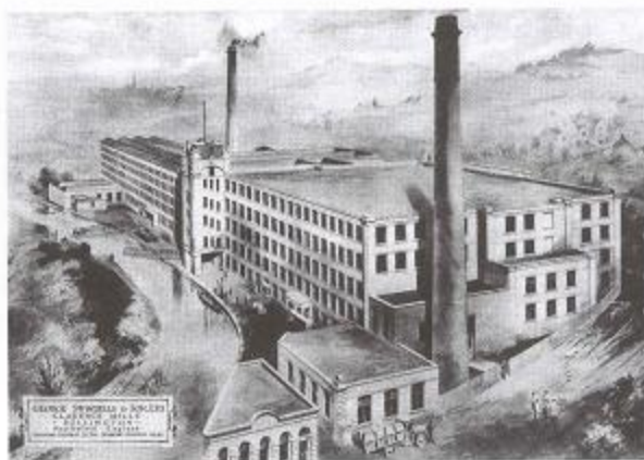
Above: Print used on certificates by the Fine Cotton Spinners & Doublers Association of Clarence Mill in 1920, showing the two former swing bridges.

By this time a number of retail business had been attracted to the ground floor of the mill on the