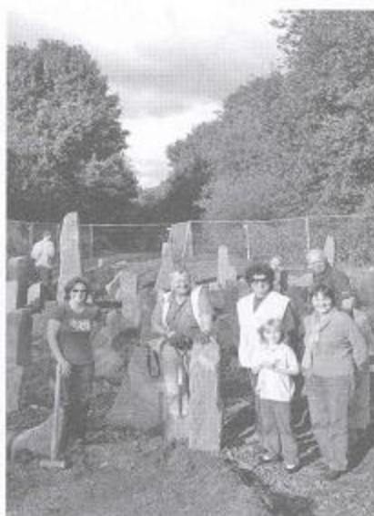
Left: The Labyrinth on final construction day.